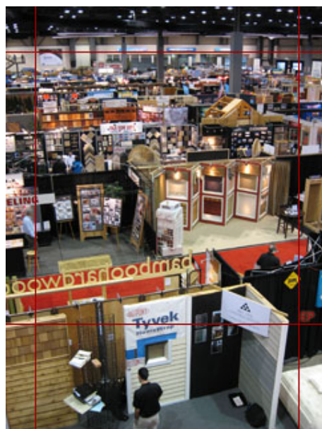
Exhibitors put the finishing touches on their booths in the moments before the opening of the 64th Annual Seattle Home Show on February 16, 2008.

Screen shots of the web site , the only way to see it while it's still in Beta.